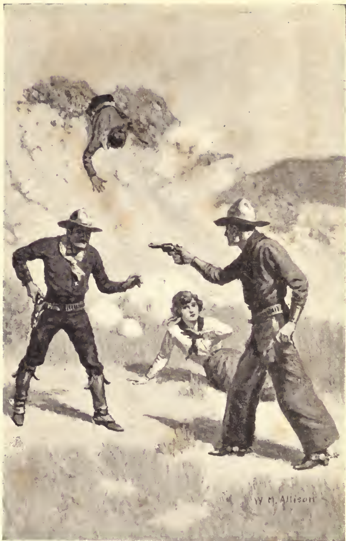
The hand flashed back again, spouting smoke and fire